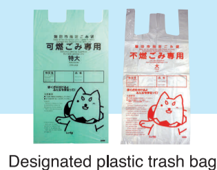
Designated plastic trash bag