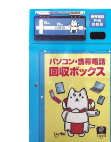
Personal computer. Mobile phone recycle box

For Inquires: Iwata Waste Resources Circulation Section (Iwata Gomi Shigen Junkan-ka) Tel 0538-37-4812 Fax 0538-36-9797